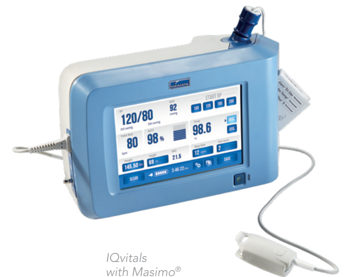
IQvitals with Masimo® optional SpO 2

Using a Ritter Barrier-Free exam chair with an automated vital signs device like Midmark IQvitals® allows you to bring more to the point of care, not only saving time, but helping reduce common transcription errors. Once vital signs data is captured, it can be ported directly into the EMR.