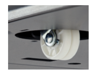
CLEAN ASSIST ROLLER SYSTEM The retractable roller base allows you to easily and safely move the chair for cleaning. (Available on the 627-011 model only.)