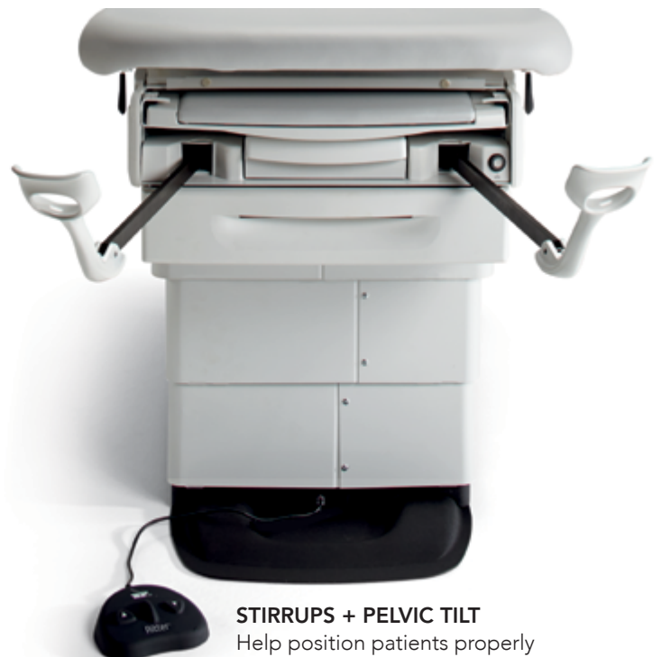
and comfortably for lower-body examinations.

Helps achieve proper positioning of the patient's arm for blood pressure capture.