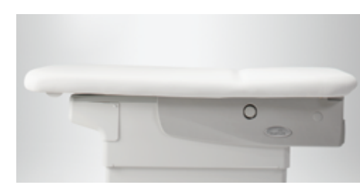
FLAT Provides an excellent working surface for exams and procedures where you need a little more space.