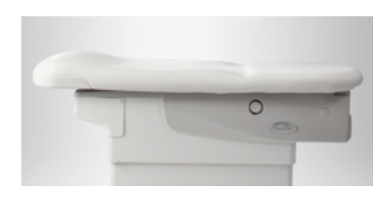
SEAMLESS Plush, seamless upholstery designed to be more comfortable for the patient and easier to clean for you.