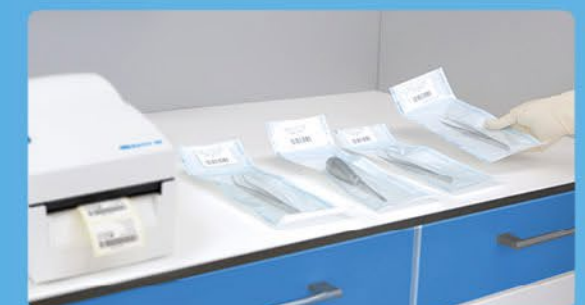
✓ Marking with MELAprint 80