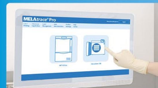
✓ Documentation & approval with MELAtrace