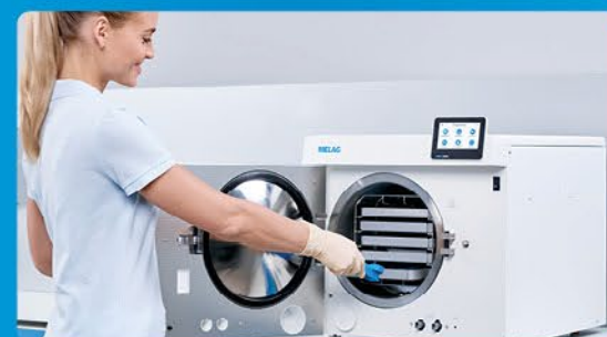
✓ Steam sterilization with Vacuclave