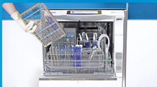
✓ Cleaning & disinfection with MELAtherm

Unique as a product, unbeatable in a system: