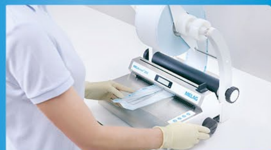
✓ Packaging with MELAseal or MELAstore