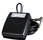
A803 Footswitch †