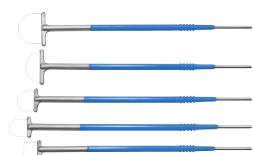
Lletz Loop Electrodes †