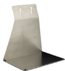
A813 Table Top Stand †