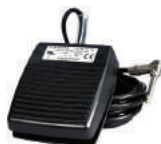
A803 Footswitch †