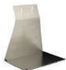
A813 Table Top Stand †