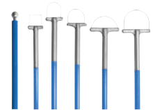
Disposable LLETZ/LEEP Loop and Ball Electrodes †