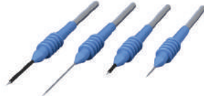
Disposable SuperCut™ Needles Electrodes †