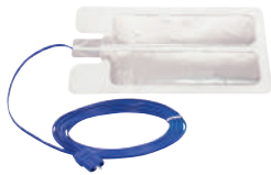
ESREC - Split Disposable Return Electrode with cord †