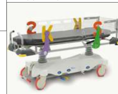
Polycarbonate paediatric side rails (optional)