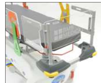
Paediatric kit head-end (optional)