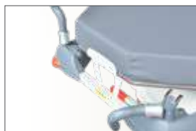
Réf CROBPT Foldable push bars head-end