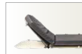
Ref CROK7 X-Ray cassette below the patient surface