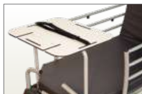
Réf CROPSC Monitor tray at foot-end